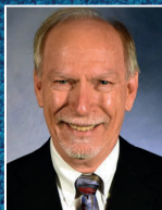
Hon. William Lynch Albuquerque