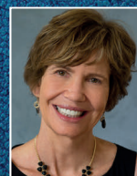
Hon. Wendy York Albuquerque