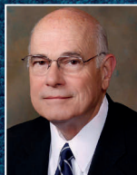
John Hughes Red River

The following attorneys are recognized for Excellence in the field of Alternative Dispute Resolution